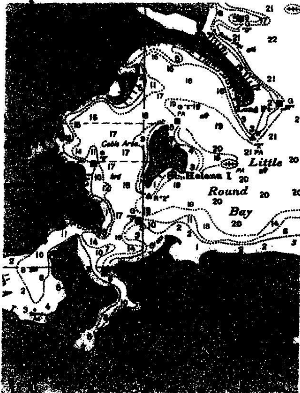
From NOAA Chart 12282—not to be used for navigation.

Other choice spots to anchor are in Hopkins Creek and Maynadier Creek, SSW of St. Helena Island.