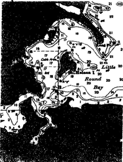
From NOAA Chart 12282— not to be used for navigation.

Other choice spots to anchor are in Hopkins Creek and Maynadier Creek, SSW of St. Helena Island.